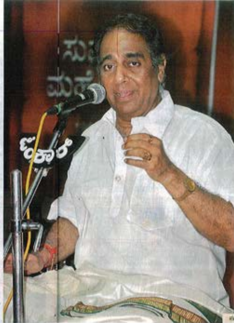
81 ವರ್ಷದ ಹಿರಿಯರಾದ

ಈ ಕಾರ್ಯಕ್ರಮವು ಈ ವರ್ಷದ ಅಕ್ಟೋಬರ್ 15 ರಂದು ಮುಕ್ತಾಯವಾಗುತ್ತದೆ. ಈ ಕಾರ್ಯಕ್ರಮವು ಈ ವರ್ಷದ ಅಕ್ಟೋಬರ್ 15 ರಂದು ಮುಕ್ತಾಯವಾಗುತ್ತದೆ.